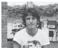
“Cool Cat” answer: That’s Bruce Springsteen